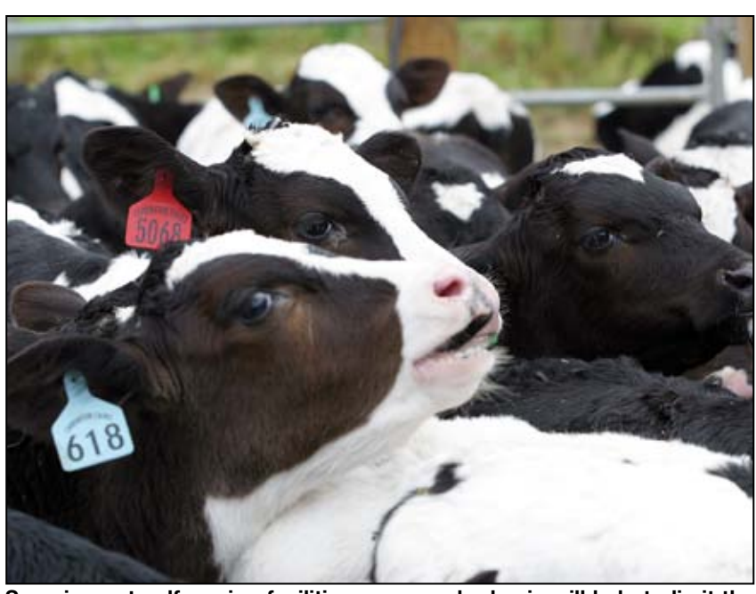
Spraying out calf rearing facilities on a regular basis will help to limit the potential for diseases to take hold and affect calf growth.